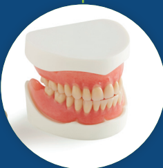
The final result

The new dentures are now ready for delivery. At this appointment, try in the prosthesis and assess fit, comfort, and function to ensure optimal results.